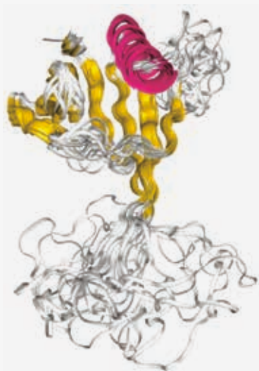
Image illustrating ICLN protein and disordered regions at the bottom and in the top-right corner.